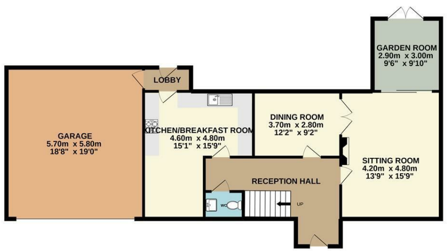
GROUND FLOOR 118.7 sq.m. (1277 sq.ft.) approx.